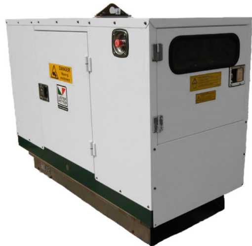
Acoustic Set (LLSA)

Please note: This photograph is for illustrative purposes only. Actual product received may change depending on the agreed specification.