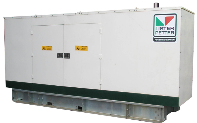
Acoustic Set (LLOA)

Please note: This photograph is for illustrative purposes only. Actual product received may change depending on the agreed specification.