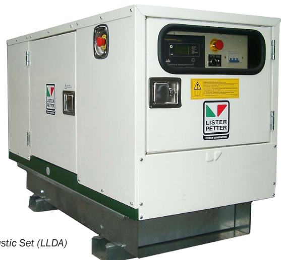
Acoustic Set (LLDA)