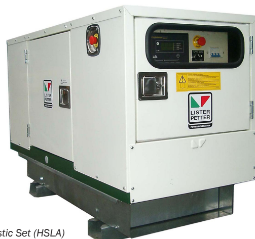
Acoustic Set (HSLA)