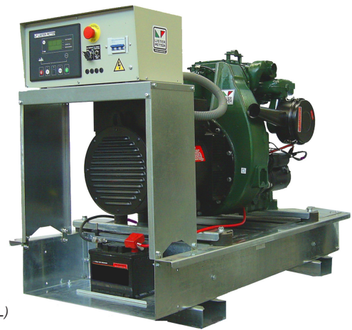
Open Set (HSL)